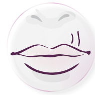
LIPS AND PERIORAL LINES

Add subtle volume to smooth moderate to severe facial wrinkles and folds²,³