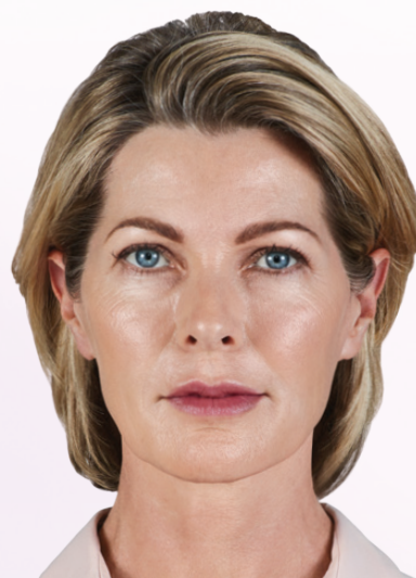
AFTER 1 MONTH