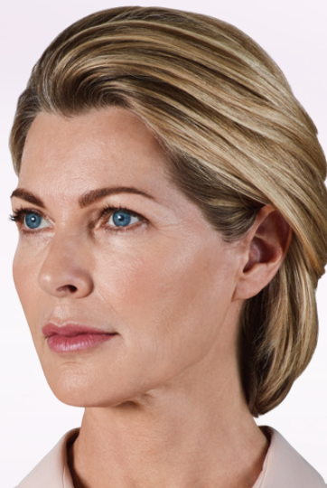
AFTER 1 MONTH