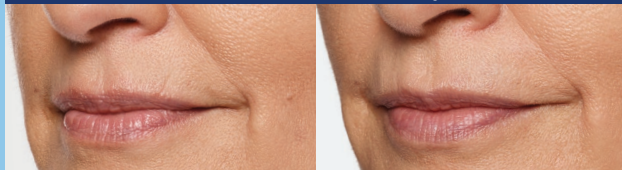
After (Day 7)

0.5 mL of Restylane Silk in lips. 0.5 mL of Restylane Silk in perioral (lip) lines around the mouth.