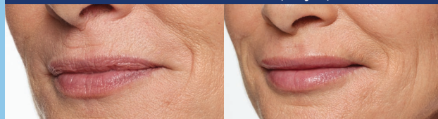
After (Day 7)

1.5 mL of Restylane ® Silk in lips. 0.8 mL of Restylane Silk in perioral (lip) lines around the mouth.