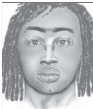
Composite sketch of sex assault suspect [Glendale Police]