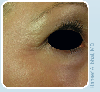
Before After Individual results may vary and are not guaranteed.