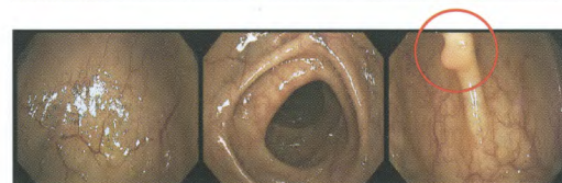
Fuse™ Colonoscope Panoramic 330° Field of View