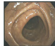
Standard Colonoscope Limited 170° Field of View

According to the American Cancer Society, colorectal cancer (CRC) is the third leading cause of cancer-related deaths in the United States when men and women are considered separately, and the second leading cause when both sexes are combined. CRC is expected to cause approximately 50,830 deaths this year while another 150,000 new cases will be diagnosed.