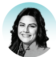
NANETTE BARRAGÁN United States House of Representatives 44th Congressional District