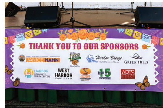
HarborCHC was proud to sponsor multiple events last year, including the San Pedro Dia de los Muertos Festival, which allowed us to support and celebrate our community.