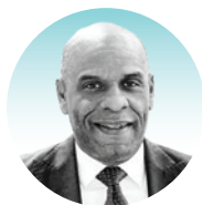
STEVEN BRADFORD California State Senate 35th District