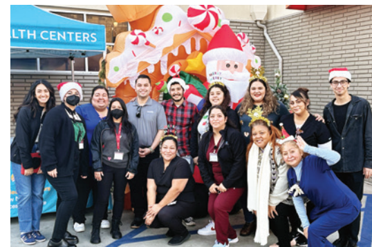
Our staff gathered to celebrate the holiday spirit at the annual HarborCHC Holiday Toy Drive, where more than 300 children in our community received a gift.