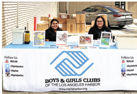
Essential community partners — such as the Boys & Girls Clubs of the Los Angeles Harbor — were welcomed to our events last year, including the Back to School Fair.