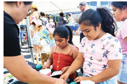
Hundreds of students and youth from across the community left our Back to School Fair with supplies as they prepared for the start of the new school year.