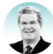
TIM MCOSKER Los Angeles City Council 15th District