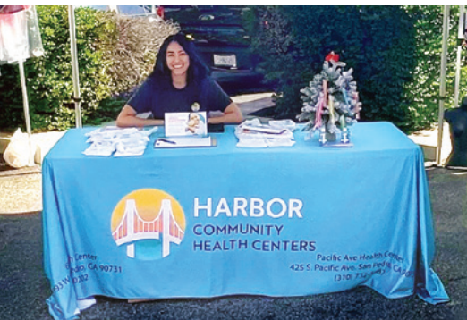
Our outreach team attended many community events in 2023 including the San Pedro Farmers Market to share information about services and benefit enrollment assistance at HarborCHC.