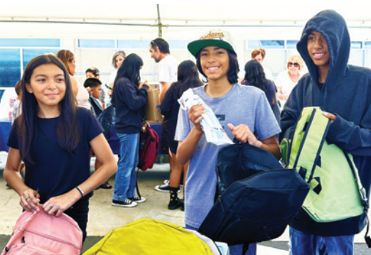
Youth in our community were offered free school supplies, including backpacks, pencils and pens, notebooks and more, at our 2023 Back to School Fair.

Every year, HarborCHC gathers with partners, families and community members to celebrate and support our region. In 2023, we distributed toys and other gifts during our annual Holiday Toy Drive to more than 300 children. Our Back to School Fair kicked off the school year with hundreds of youth in our community receiving essential supplies. We also met with elected officials to share our vision to support the growing needs of our community.