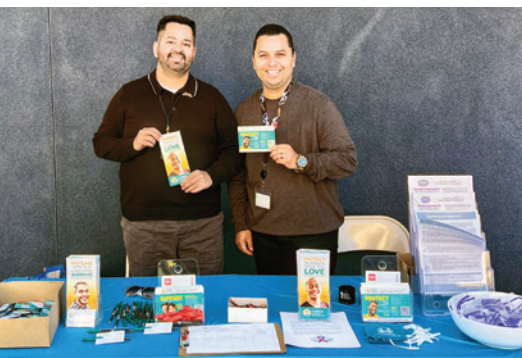
Last year, HarborCHC outreach and program staff observed multiple health awareness days — including AIDS Awareness Day — by sharing information and discussing resources and services available to community members.