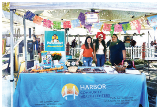
Local events like the San Pedro Dia de los Muertos Festival offered our staff a chance to connect with our community and share information about the resources available at HarborCHC.