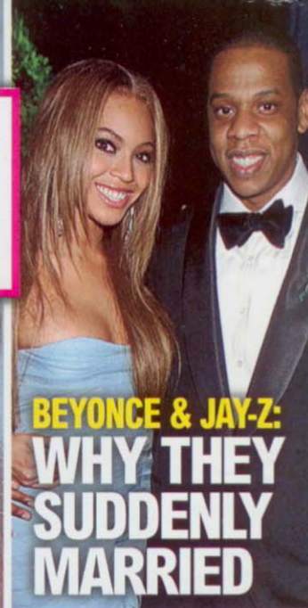
BEYONCÉ & JAY-Z: WHY THEY SUDDENLY MARRIED