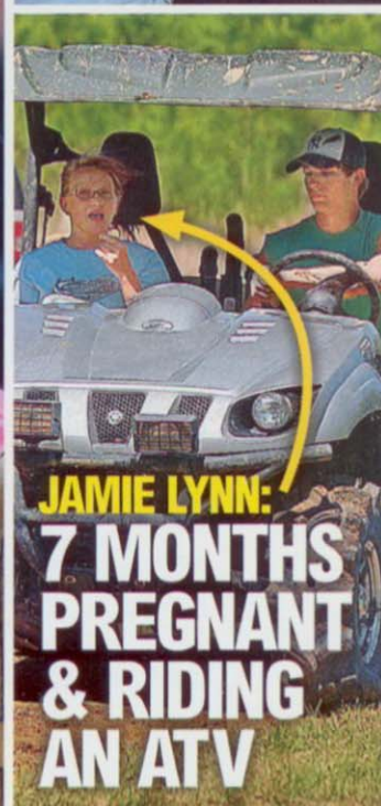
JAMIE LYNN: 7 MONTHS PREGNANT & RIDING AN ATV