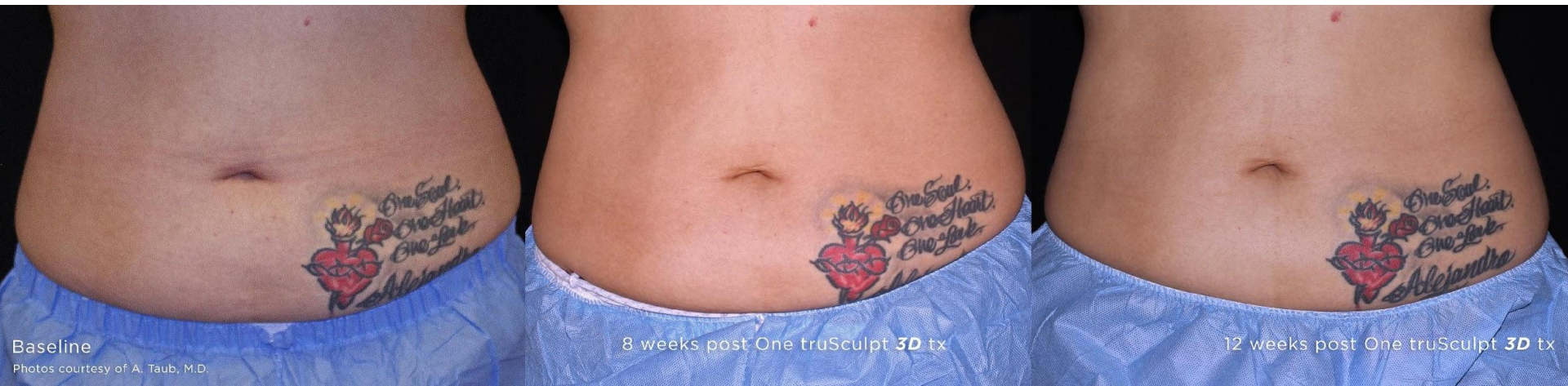
Baseline Photos