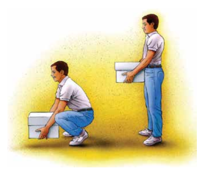
Good posture is important to avoid future episodes. A therapist can provide training in proper standing, sitting, and lifting.

Physical therapy. Specific exercises can strengthen your lower back and abdominal muscles. A physical therapist can also apply traction if you have a herniated disk in your neck.