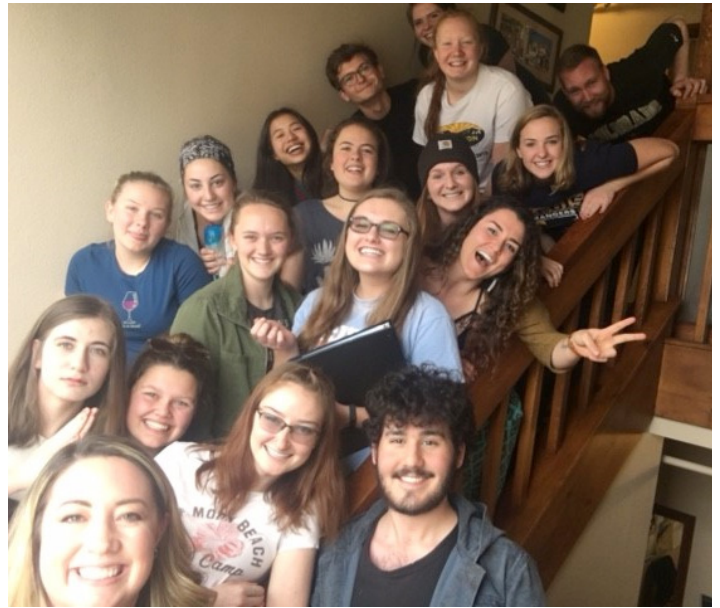
This year's SHAPE group includes 15 youth from 5 high schools throughout Boulder County. Pictured are the SHAPers with their adult mentors.

This Spring, several SHAPers met with their state legislators at Reproductive Freedom Lobby Day (see previous page ). They have 15 sexual health presentations scheduled in BVSD middle school classrooms this semester, as well as a panel for parents on communicating with kids about sex. SHAPers will also be speaking to the Denver Foundation and the City of Boulder Youth Opportunities Program on the importance of positive youth development and in support of funding for Women's Health Youth Services program. ❖