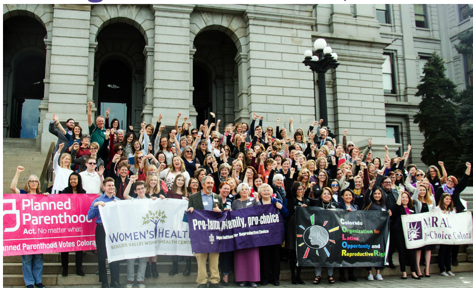
Women's Health and our partners in the Colorado Reproductive Freedom Coalition rally outside the Colorado State Capitol on March 16 as part of our annual statewide Reproductive Freedom Lobby Day.