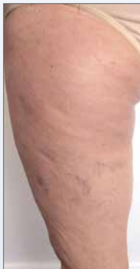
After four Exilis Ultra Smooth treatments