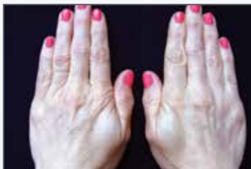
After one Exilis Ultra Smooth Tx