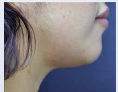
After two Exilis Ultra Tight treatments