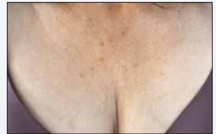
After two Exilis Ultra Smooth treatments