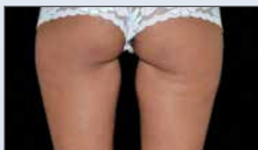
After three Exilis Ultra Lift treatments

"I would estimate that more than 75% of the patients I see who undergo a BTL Exilis Ultra procedure end up doing at least one other body area because they were pleased with the their initial treatment."