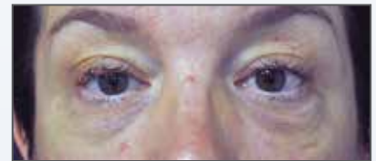
After two Exilis Ultra Tight treatments