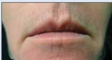
After one Exilis Ultra Plump Tx

"It is extremely effective and multipurpose, and it works on far more body areas than any other device in its class. We don't even know yet all the things that can be done with it."