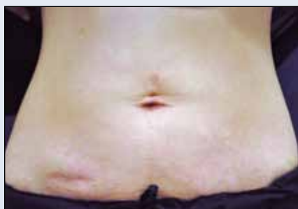
After six Exilis Ultra Tone treatments