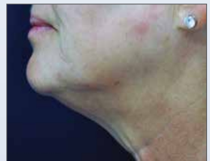
After two Exilis Ultra Tight treatments