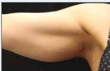
After four Exilis Ultra Lift treatments