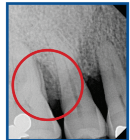
Pre-Op: 10, 10