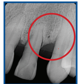
2 Years Post-Op: Probing Depths 3, 3