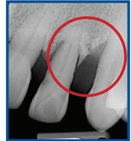
Pre-Op: #11 Mesial Probe Depths 10, 10