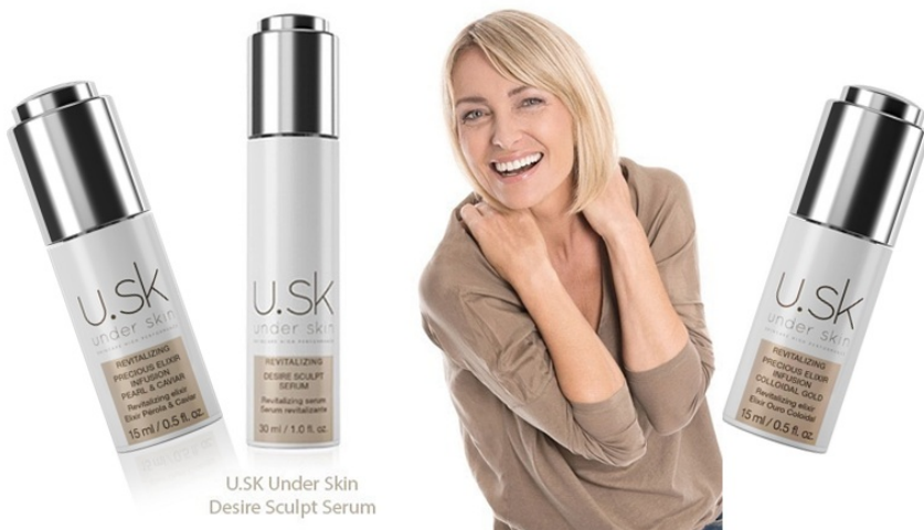
U.SK Under Skin Desire Sculpt Serum

Products of the U.SK Anti-Aging collection have multiple benefits and act in the promotion of cell renewal as well as cell defense. They reduce, prevent and reverse the signs of aging as well as restore epithelial relief to achieve uniquely healthy and beautiful skin.