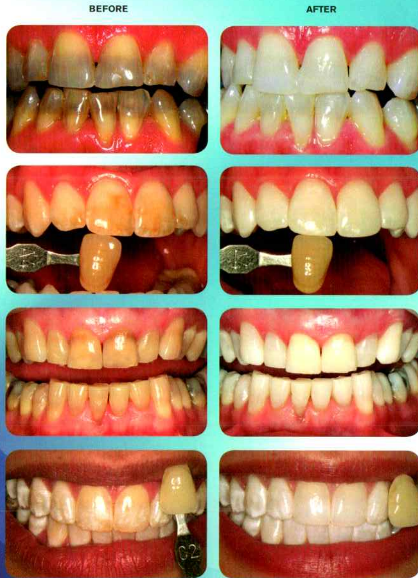
(ACTUAL PATIENT RESULTS)

The KÖR Whitening System was invented by internationally renowned cosmetic dentist and whitening science expert, Dr. Rod Kurthy. Thousands of dentists around the world agree that KÖR Whitening is by far the most reliable and effective whitening system ever developed. In fact, the KÖR Whitening System is so effective, it is the only recognized whitening system that whitens even tetracycline-stained teeth in a short time (previously thought to be impossible). And these amazing KÖR Whitening results are achieved with minimal to no sensitivity!