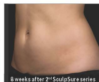
8 weeks after 2 nd SculpSure series