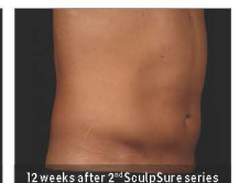
12 weeks after 2 nd SculpSure series

AREAS TREATED: Upper & lower abdomen, left & right love handles