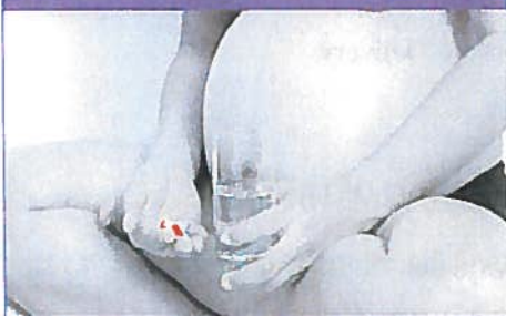
Pregnancy with and/or without meds