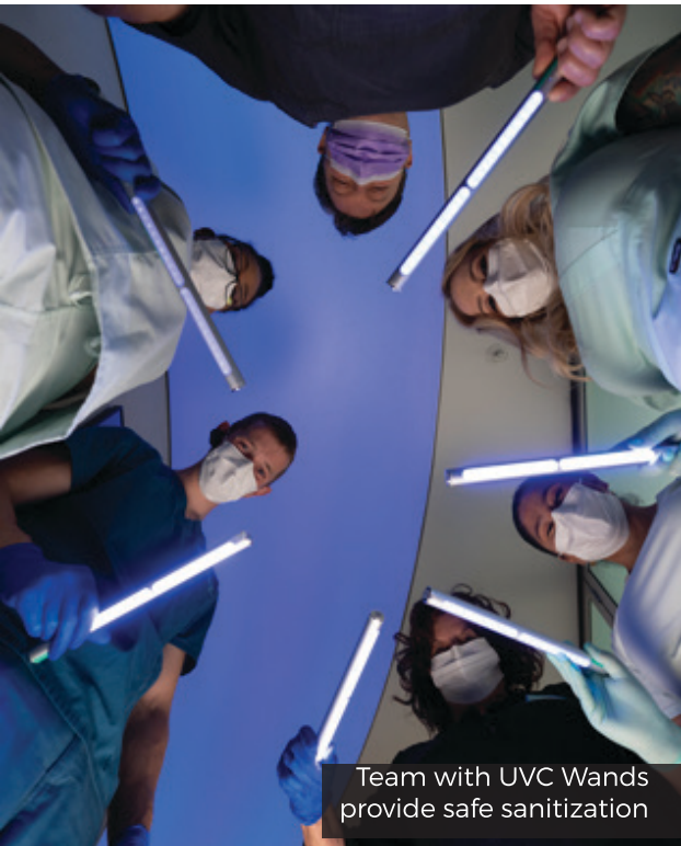
Team with UVC Wands provide safe sanitization