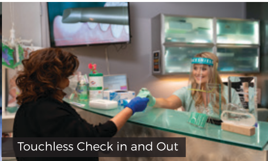
Touchless Check in and Out