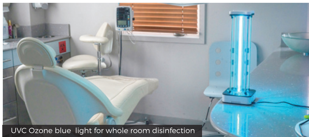
UVC Ozone blue light for whole room disinfection