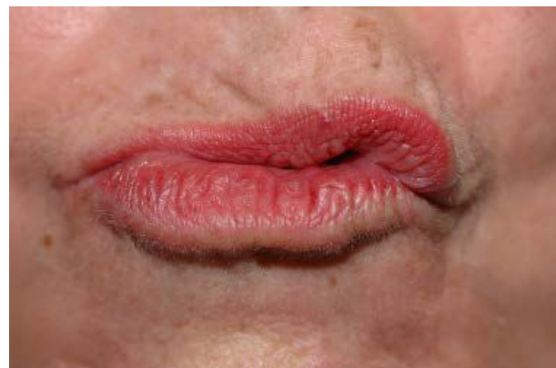
Figure 2. Paresis of the elevator muscles of the right side of the upper lip.

*Department of Dermatology, Mayo Clinic, Jacksonville, Florida