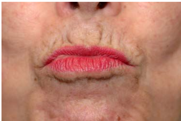
Figure 3. Resolution of paresis.

vary in their reports of which branch of the facial nerve is most frequently damaged in face-lift procedures, the buccal, marginal mandibular, and temporal nerves are the three branches most cited. 3-5 The true rate of facial nerve injury in skin cancer surgery is unknown. The temporal and marginal mandibular nerves are the two branches of the facial nerve at greatest risk for injury. 6 The temporal branch of the facial nerve is prone to injury during surgery on the