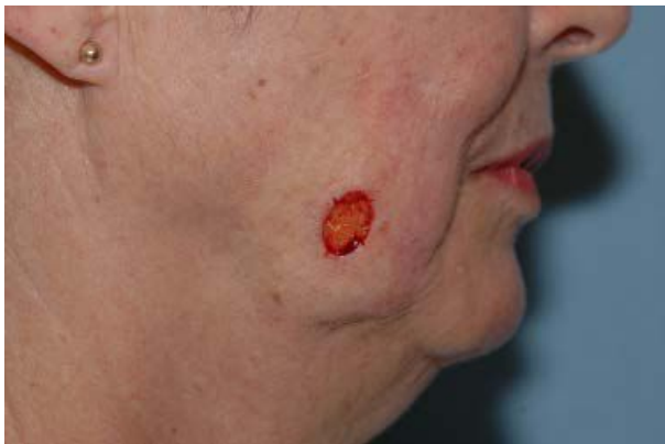
Figure 1. Defect on the lower part of the right cheek.

The facial nerve is the motor nerve that innervates the muscles of facial expression and mastication. It has five branches: temporal, zygomatic, buccal, marginal mandibular, and cervical. Injury to branches of the facial nerve causes functional and cosmetic morbidity. The rate of permanent injury to branches of the facial nerve with face-lift procedure ranges from 0.4% to 2.6%. 1 The rate of transient facial nerve injury with these procedures is much higher at a reported 16%. 2 Although different series