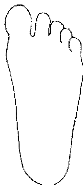
BOTTOM OF FOOT