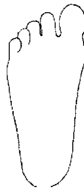
BOTTOM OF FOOT