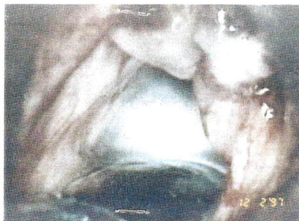
Figure 3. Case 3: Laryngoscopy shows a right hemangioma extending into the anterior commissure in a 38-year-old man.

Pediatric laryngeal hemangiomas are usually accompanied by an abnormal cry, persistent stridor, and chronic