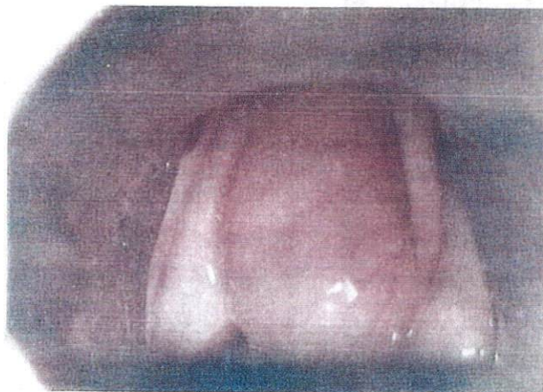
Figure 1. Case 1: Laryngoscopy shows a large, obstructing hemangioma on the right vocal fold in a 35-year-old woman.

being returned to the care of her primary care physician. Her glottic region returned to normal, and her voice improved. She experienced no further breathing difficulties, even in the supine position, despite the fact that she continued to smoke. She refused a videostroboscopic examination postoperatively. She was followed for approximately 18 months and was doing well, with no breathing or speaking difficulties.