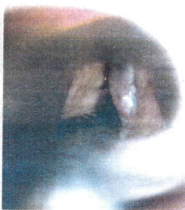
Figure 2. Case 2: Videostroboscopy shows a hemangioma on the right true vocal fold in a 64-year-old woman.

Case 4. A 34-year-old woman came to the clinic complaining of hoarseness. She had smoked one pack of