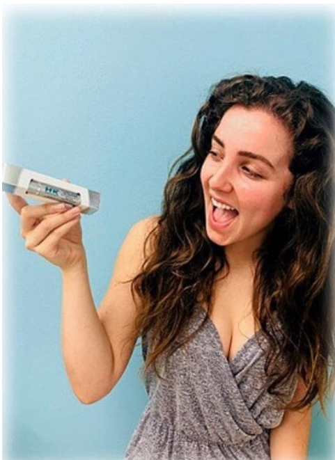
June's Raffle Winner of our HK Lip Plumper

Protect your skin from the sun's harmful rays! Buy both the Mineral Brush & Eryfotona Actinica DNA Repair together to receive 10% off.